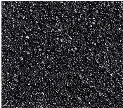
DECRA SHAKE Charcoal