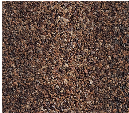
DECRA SHAKE Chestnut