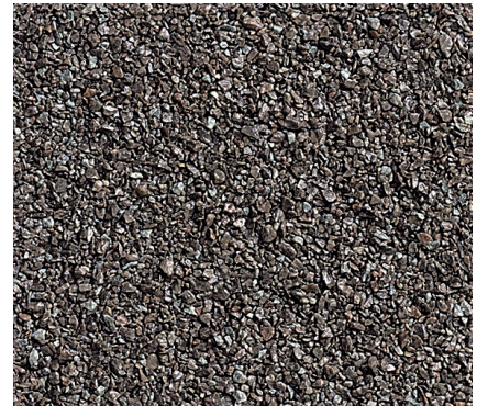
DECRA SHAKE Granite Grey