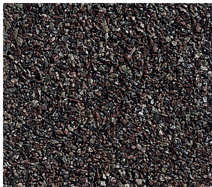
DECRA SHAKE Shadowwood