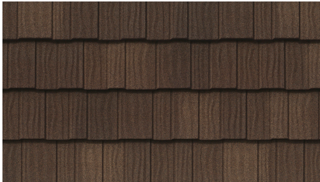
DECRA SHAKE XD Antique Chestnut