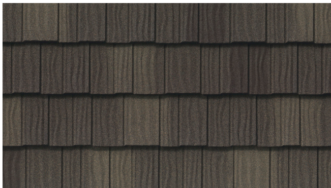
DECRA SHAKE XD Pinnacle Grey